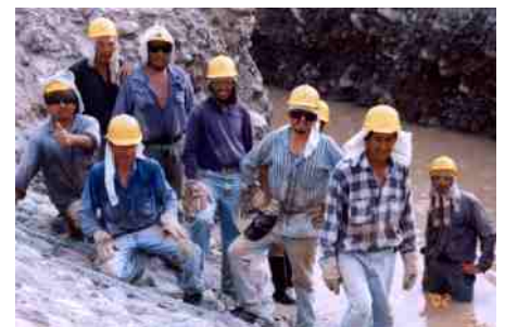
GasAtacama, Argentina (operations monitoring/design) GasAtacama