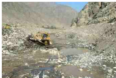
Camisea, Peru (design/field engineering) TECHINT/TGP