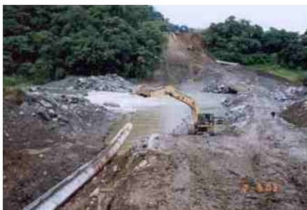
OCP, Ecuador (design/field engineering)