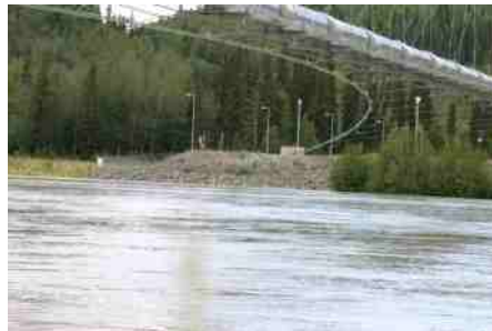
Trans-Alaska Oil Pipeline (operations monitoring/design) VECO/Alyeska Pipeline Service Co.