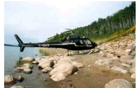
Mackenzie Gas Pipeline, Canada (studies) Colt KBR/Imperial